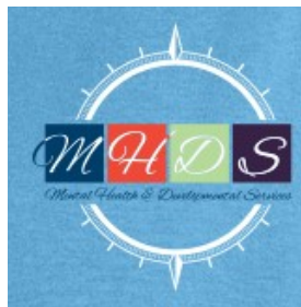
Front of T-Shirt Heart Shot

Anchors & Stripe prints and sailing style! Dress like you're about to board a boat bound for the open water!