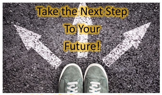
Friday, 8/30/24 — 11 am—2pm MHDS—27 Conrad Drive — Jackson TN Light Lunch — Door Prizes every 30 minutes

Open to All West TN Counties Special Education Students, Family & Teachers!